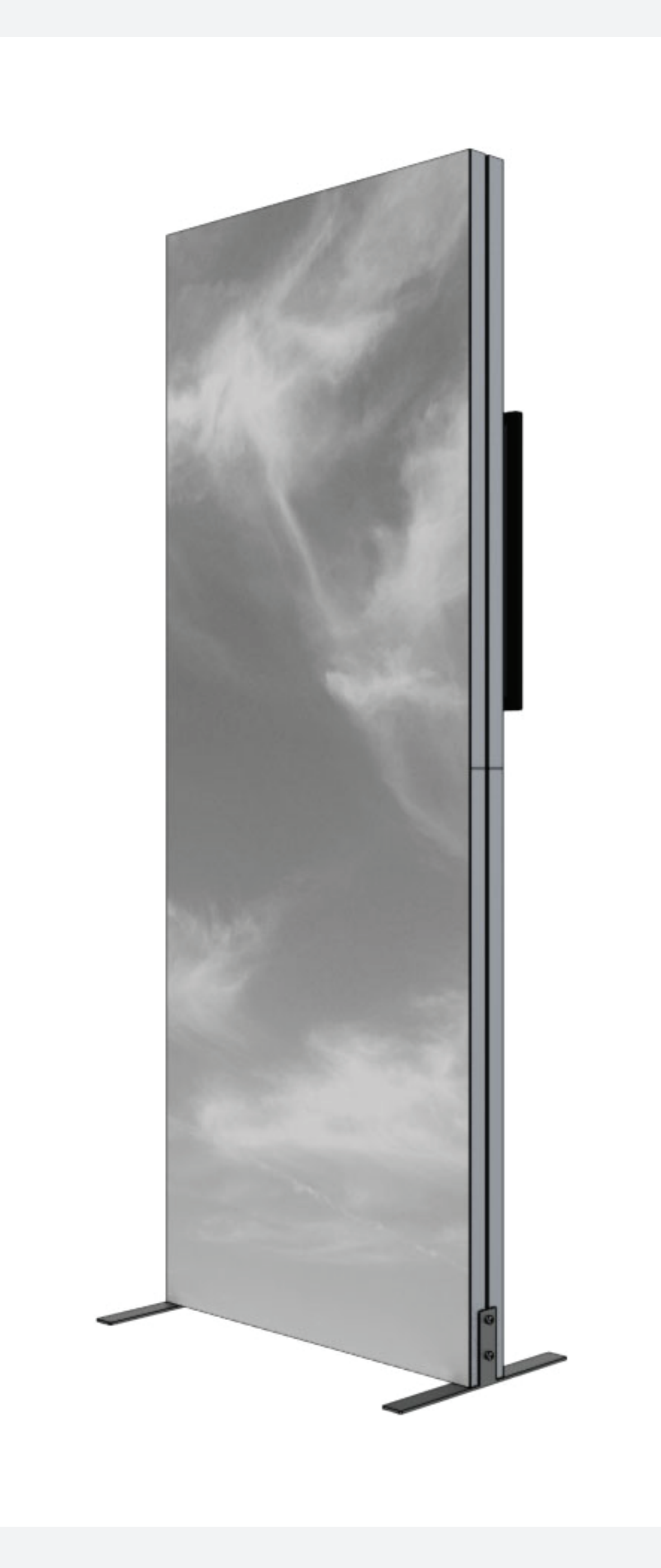
Double-Sided with Single Monitor (back view)