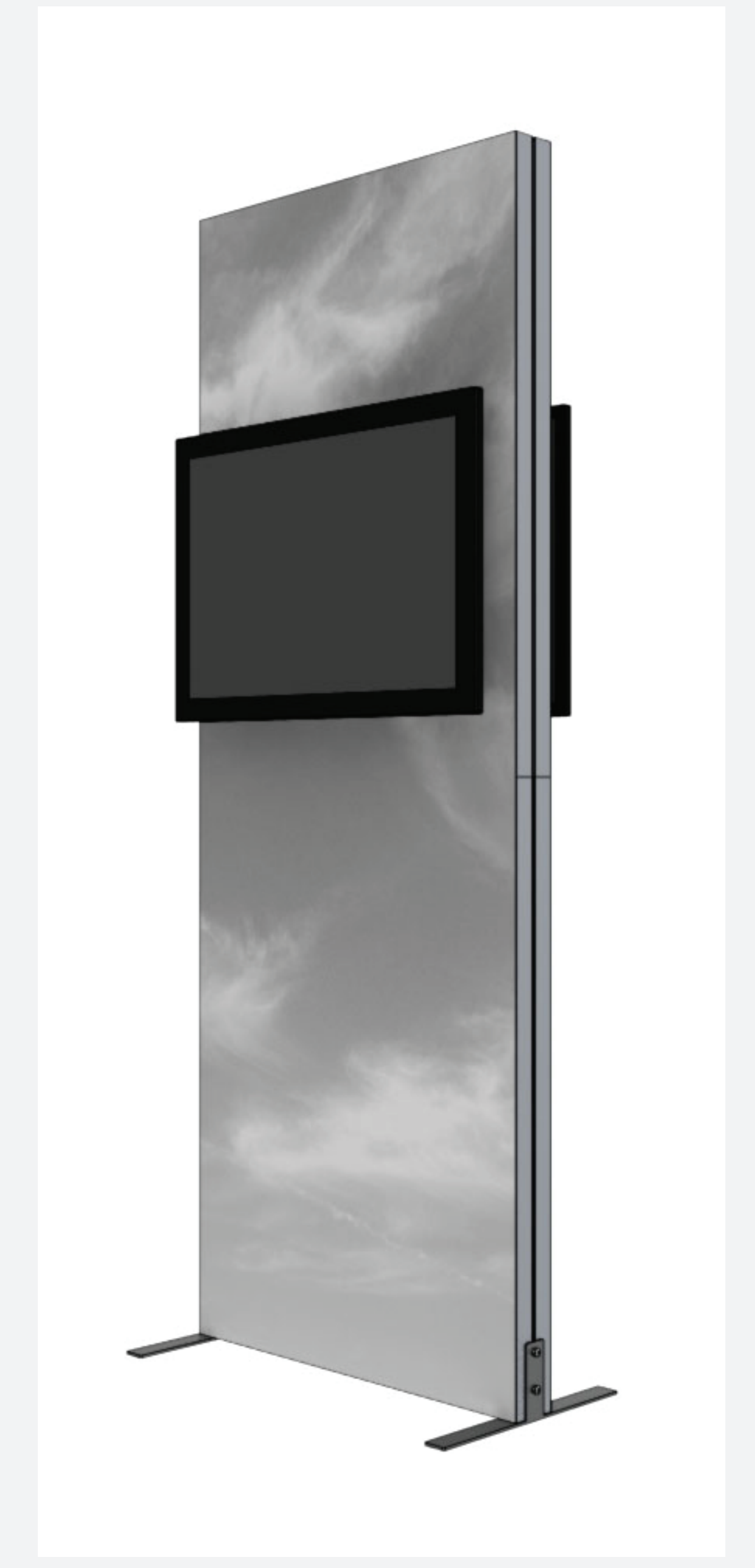
Double-Sided with Double Monitors (Monitor also on back)

Designers: Final layout should be proofed with client before being sent in for printing.